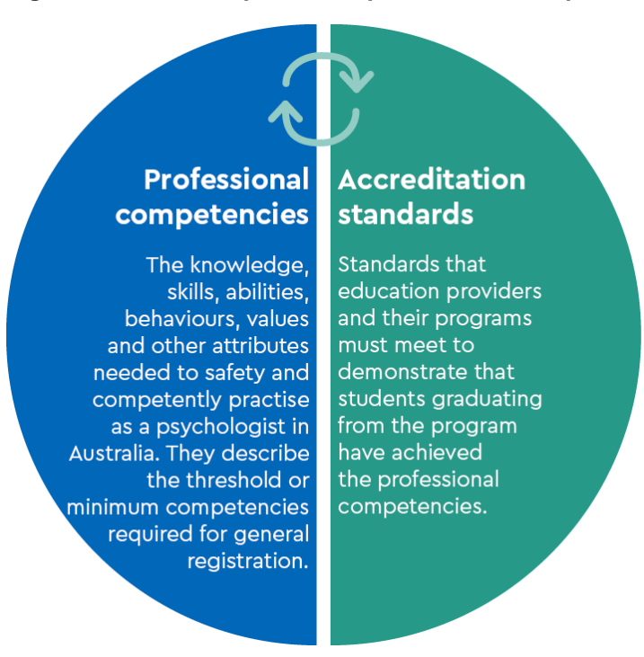
Figure 1: Relationship between professional competencies and accreditation standards

Professional competencies are typically referenced or embedded in the accreditation standards for approved programs of study and considered as part of the assessment of programs and providers. The competency requirements for a Board-approved qualification are detailed in the <u>APAC Accreditation Standards for Psychology Programs</u> (APAC Standards). The accreditation standards require education providers to design and implement programs and curriculum that map to all the professional competencies for psychology (see Figure 1).